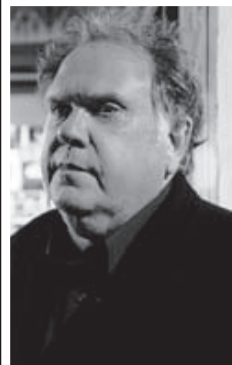
Maury Chaykin in a scene from the HBO series Entourage.

CANADIAN ACTOR'S CAREER SPANNED 35 YEARS